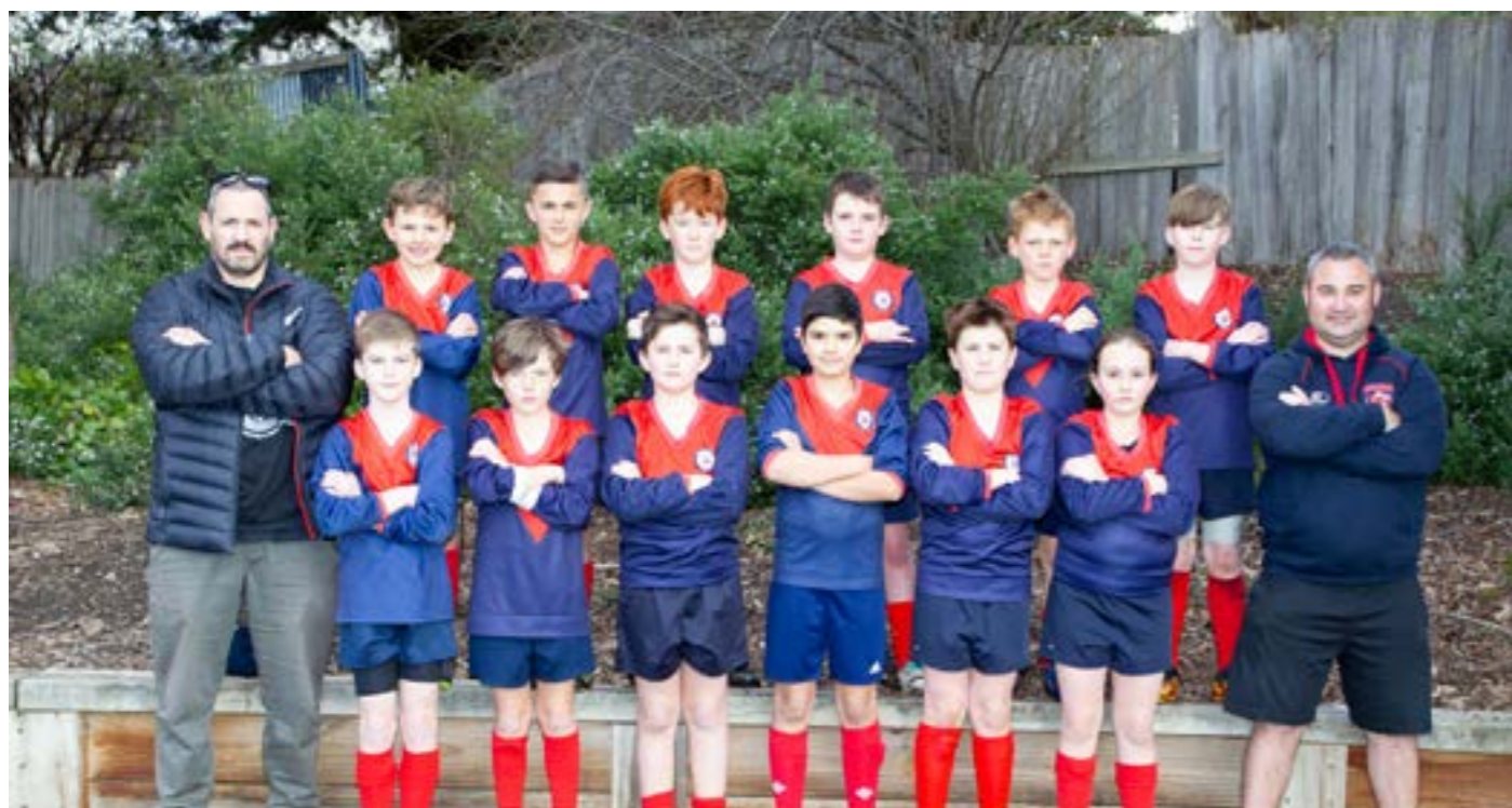
Under 10 Red