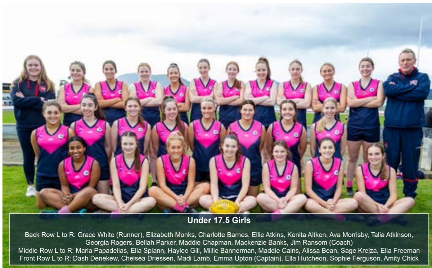
Under 17.5 Girls