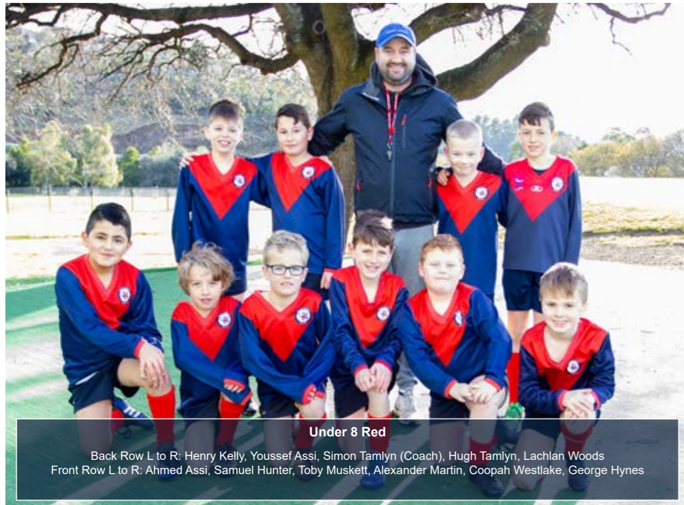
Under 8 Red