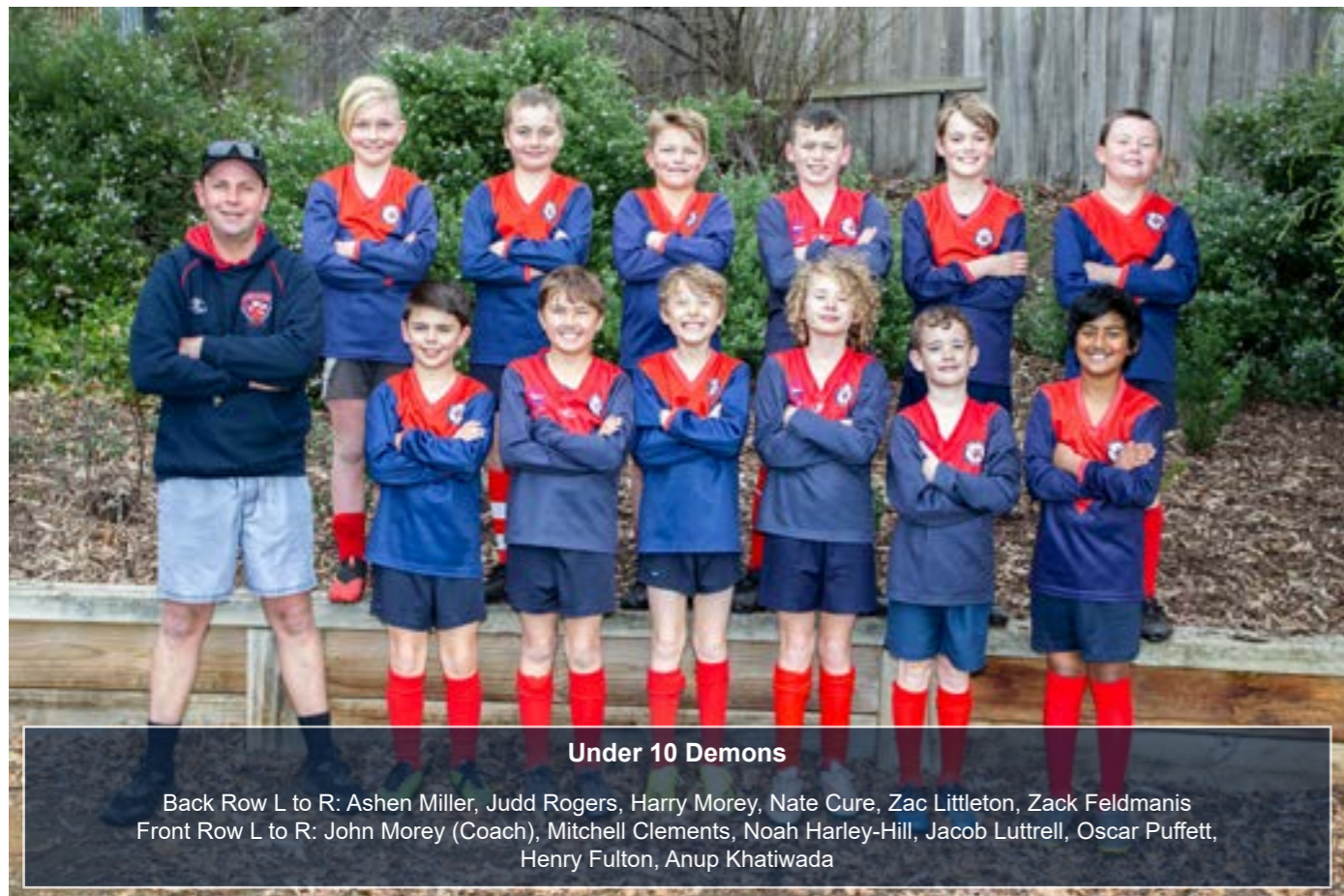
Under 10 Demons