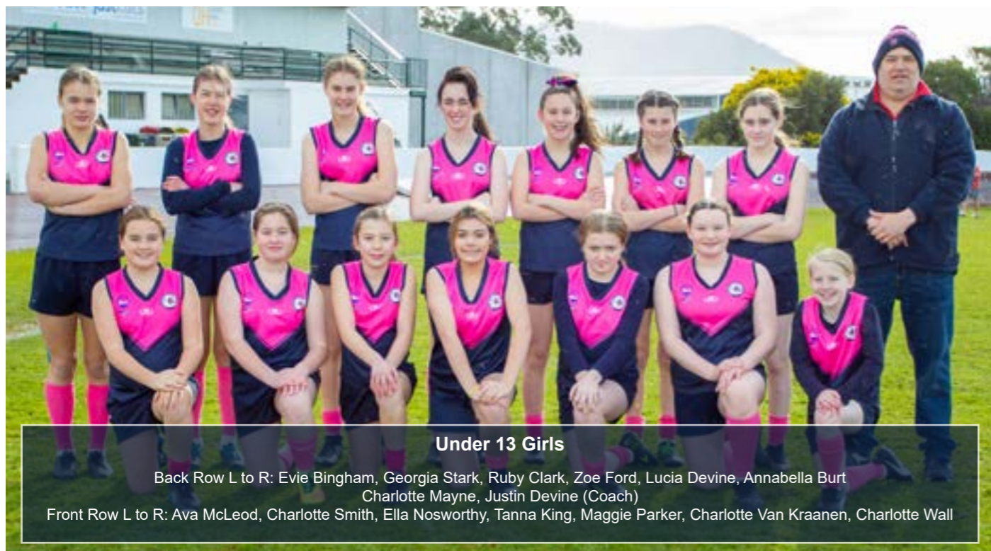
Under 13 Girls