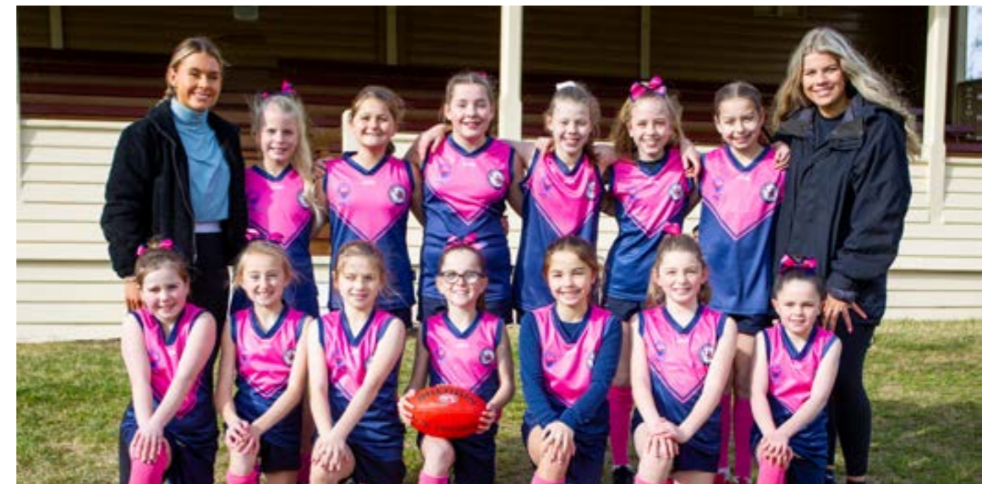
Under 11 Girls