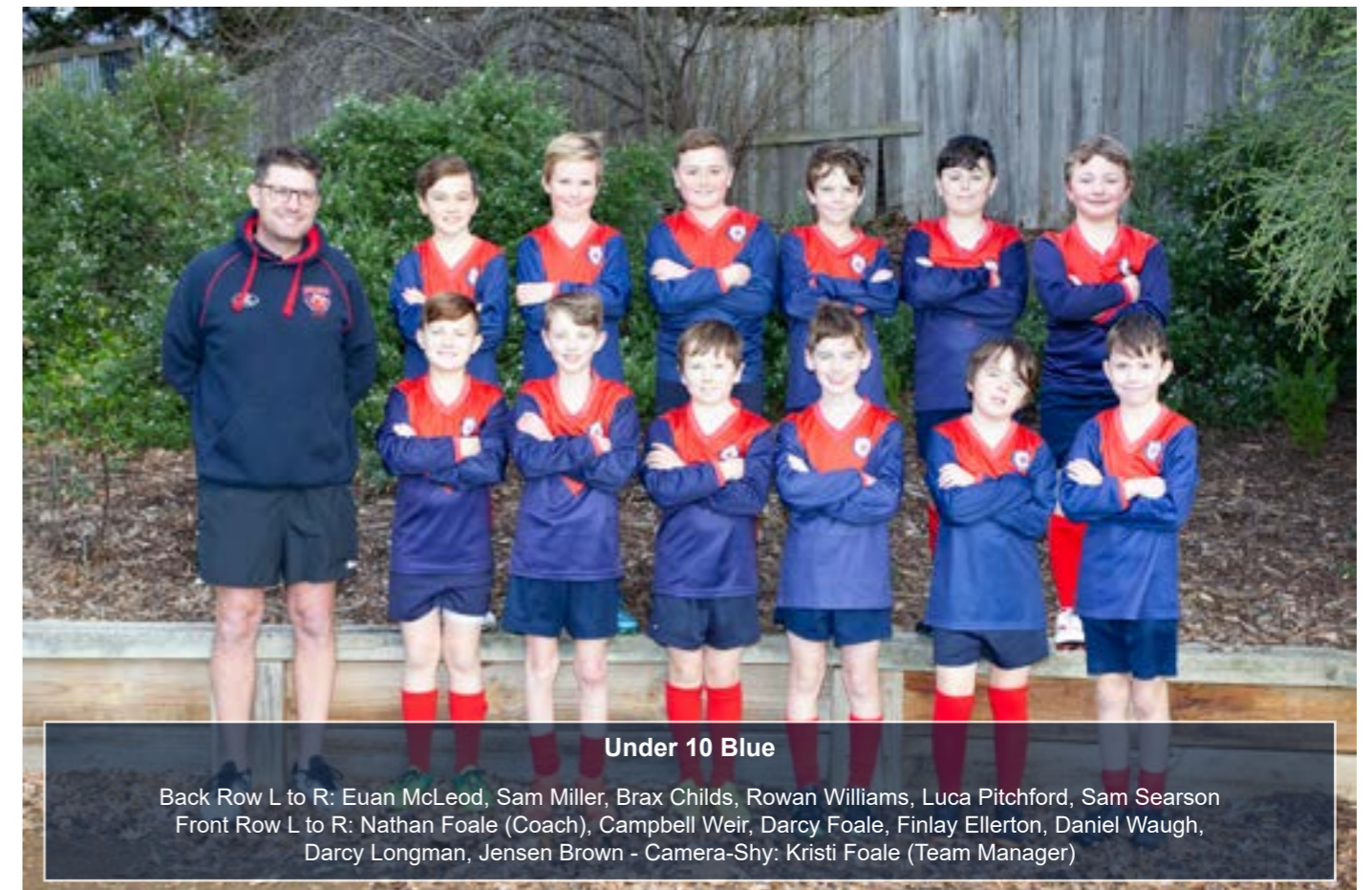
Under 10 Blue