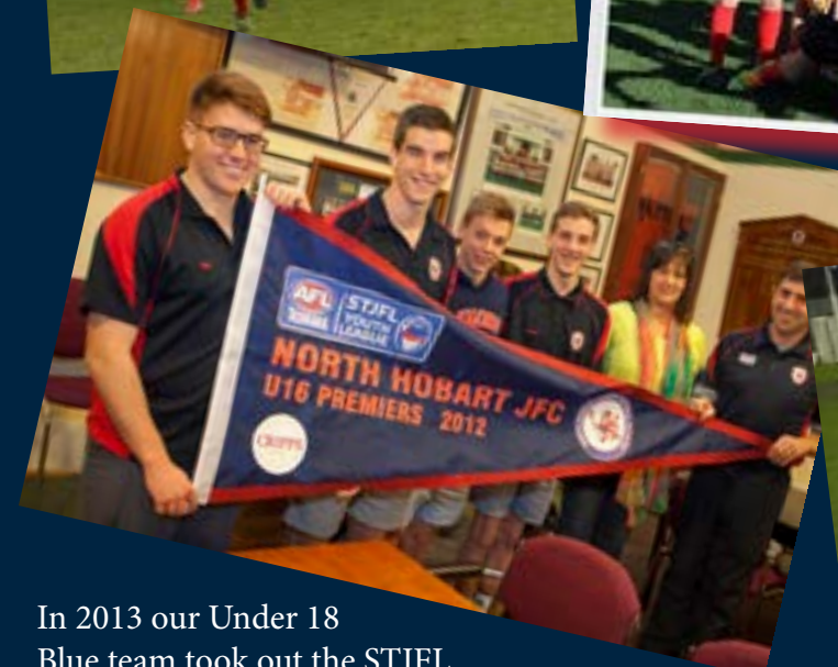
In 2013 our Under 18 Blue team took out the STJFL premiership in an exciting & hard fought contest.

The under dogs going into the game, their gritty determination was an absolute highlight in a highly contested game.