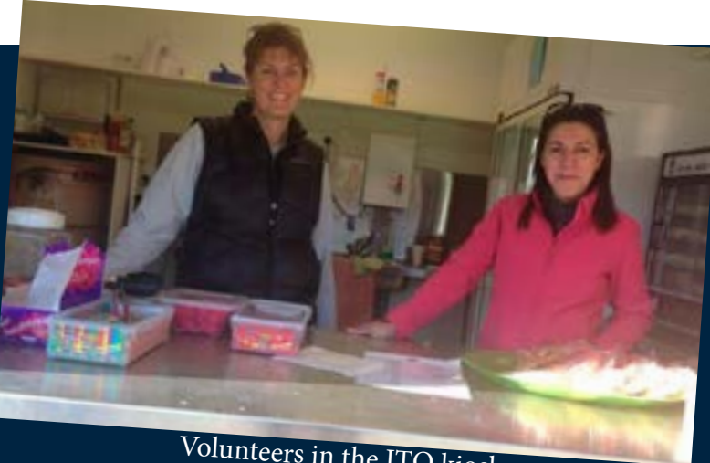
Volunteers in the JTO kiosk