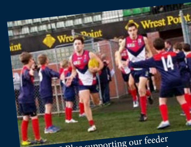
10 Blue supporting our feeder club Hobart City Football Club