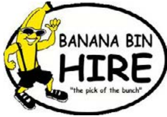
Proud Supporters of NHJFC