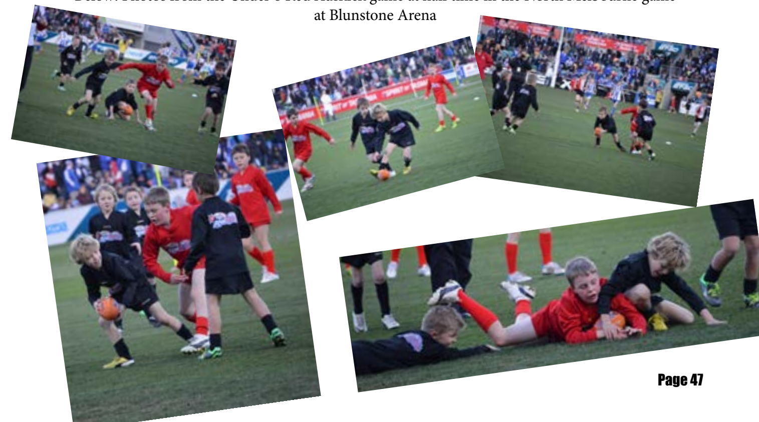
Below: Photos from the Under 8 Red Auskick game at half time in the North Melbourne game at Blunstone Arena