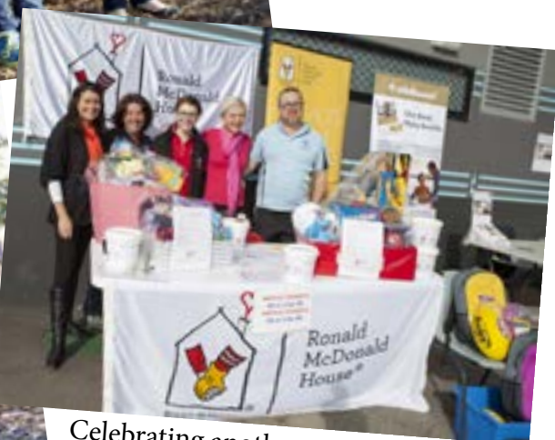
Celebrating another successful Ronald McDonald Day Fundraiser with our friends at Lindisfarne Junior Football Club