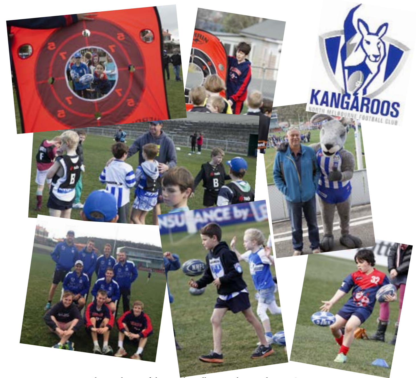
Above: photos of the North Melbourne clinic and NHJFC participants